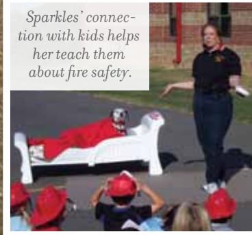
Sparkles' connection with kids helps her teach them about fire safety.